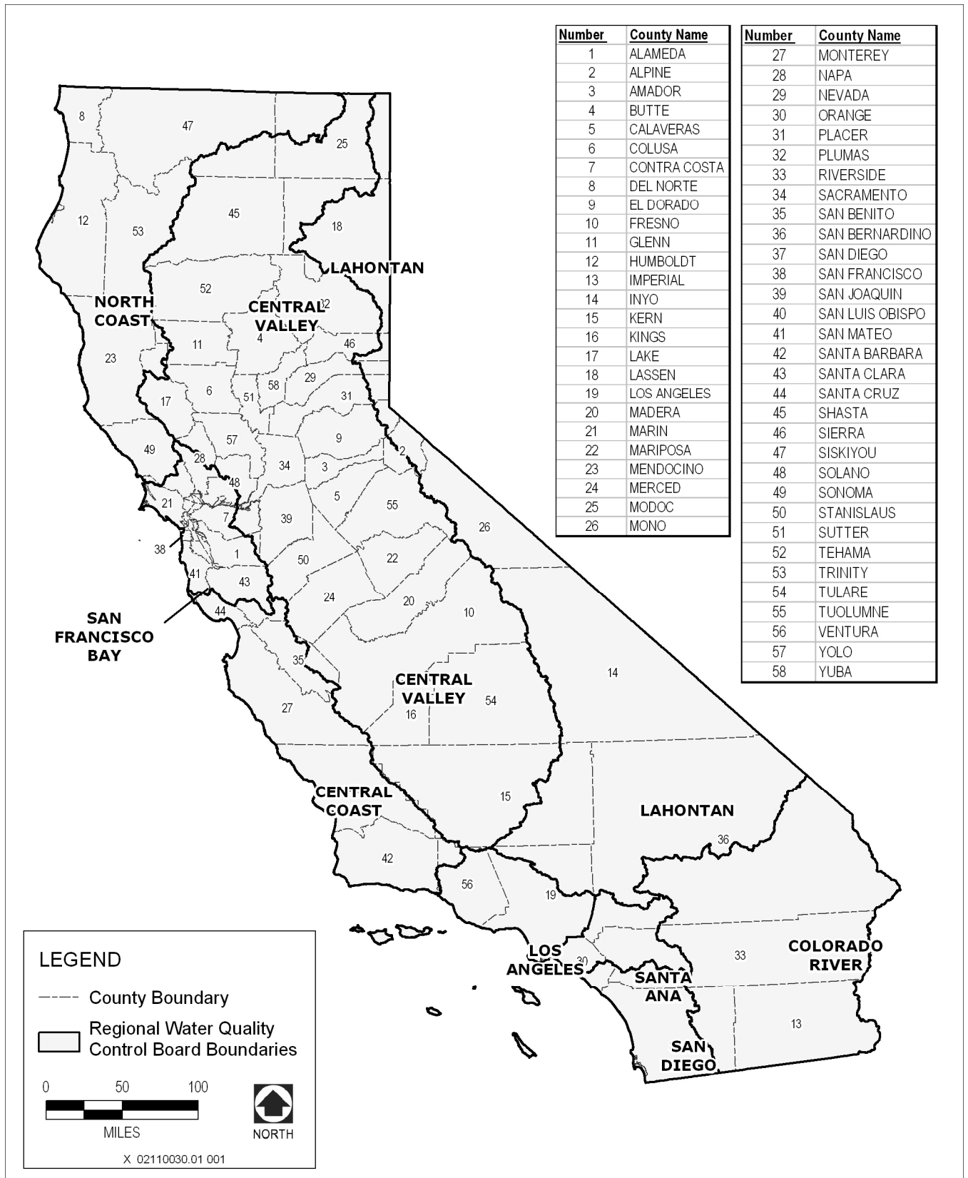
Figure 1: Regional Water Quality Control Board and County Boundaries