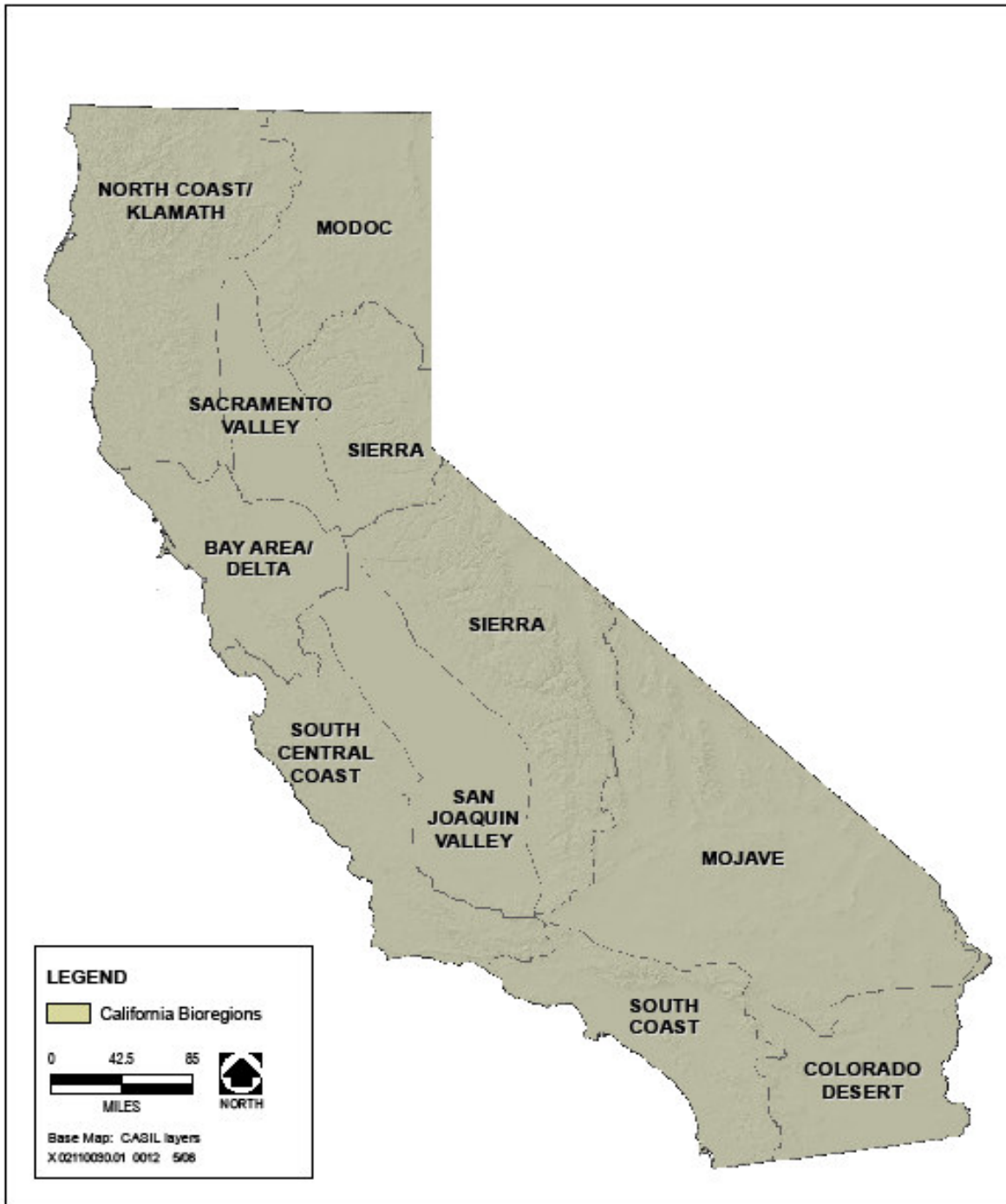
Figure 4: California Bioregions

bioregions: Modoc, Klamath/North Coast, Sacramento Valley, Bay /Delta, Sierra, San Joaquin Valley, Central Coast, Mojave Desert, South Coast, and Colorado Desert (Figure 4).